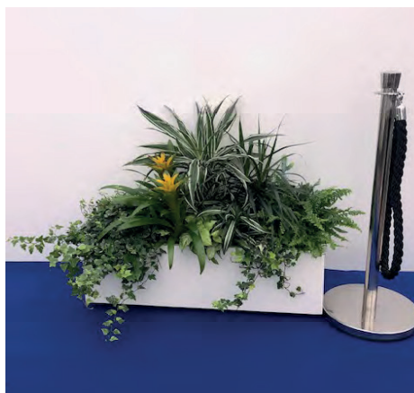
T1 - Trough - 1m x 300mm