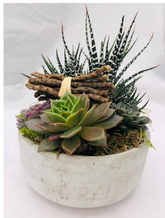
TD2 - Table Display of mixed Succulents