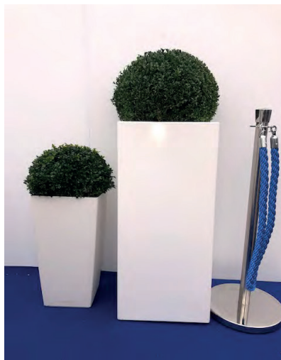
A6 - Buxus Sphere