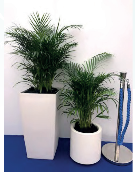
A17 - Areca Palm