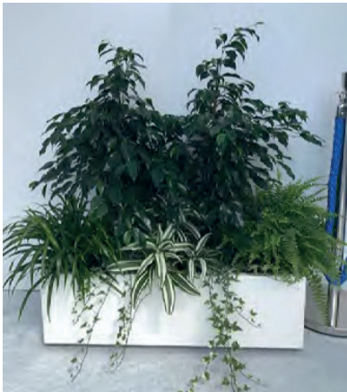
T4 - Screening Trough - 1m x 300mm