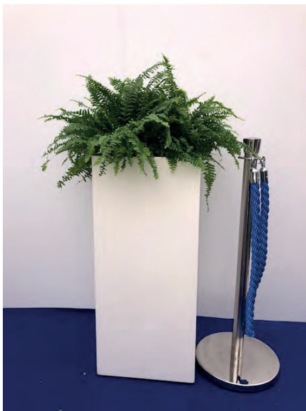
A18 - Ferns