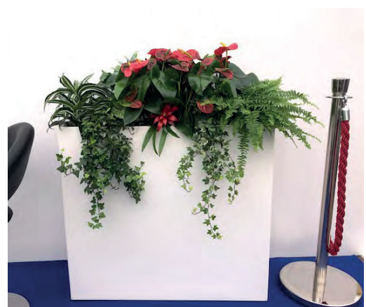
T6 - Tall Screening Trough