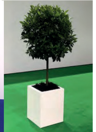
A13 - Bay Tree - Low Container