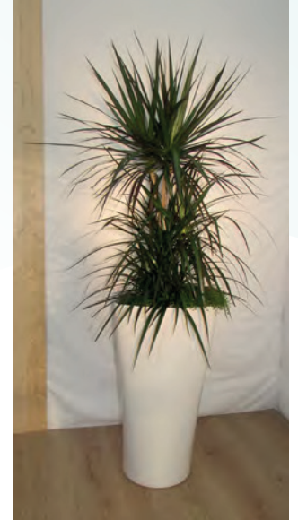
A4 - Dracena Marginata