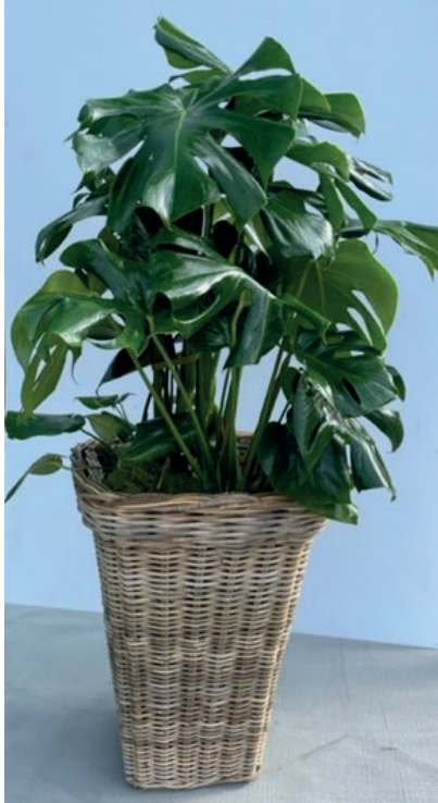
A16 - Monstera