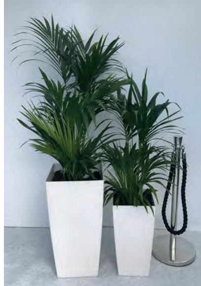
A2 - Kentia Palm