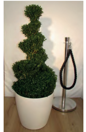
A8 - Buxus Spiral