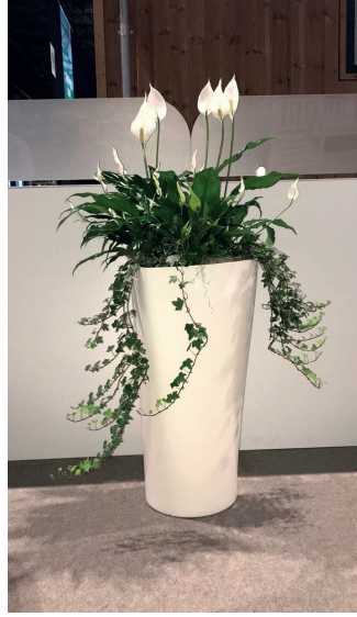
A21 - Slim white container of Lillies