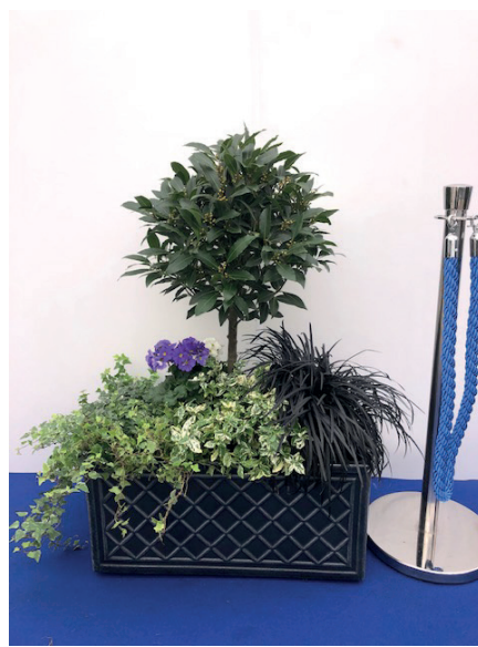
T2 - Trough