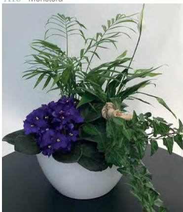
TD1 - Table Display