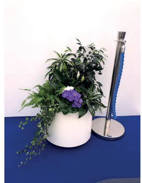
A19 - Round container of Mixed Foliage