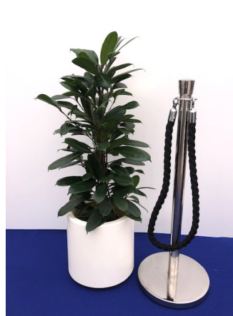
A24 - African Fig