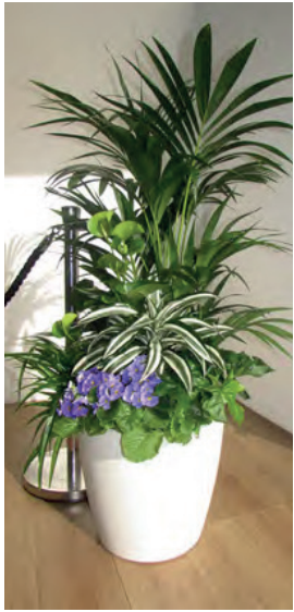
A14 - Kentia Palm