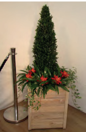
A9 - Buxus Pyramid