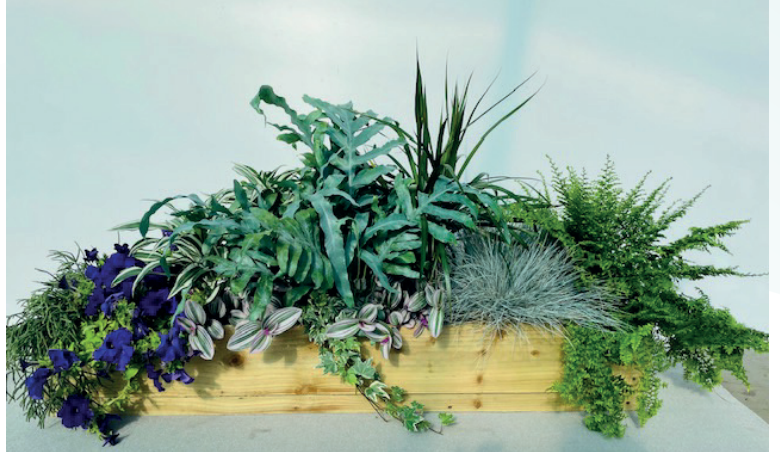
T3 - Rustic 1m Trough of Grasses and mixed foliage