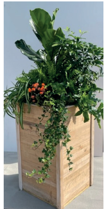
A22 - Plantation container of mixed foliage