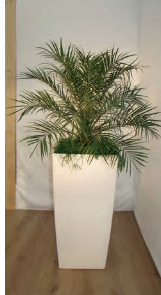
A3 - Phoenix Palm