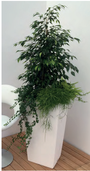
A15 - Ficus