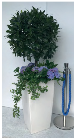
A10 - Bay Tree