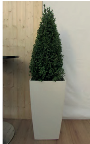
A7 - Buxus Pyramid