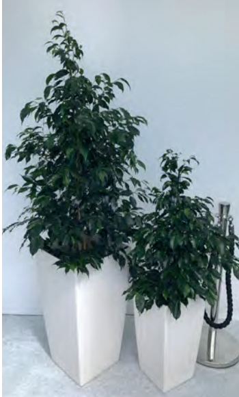
A1 - Ficus Benjaminas