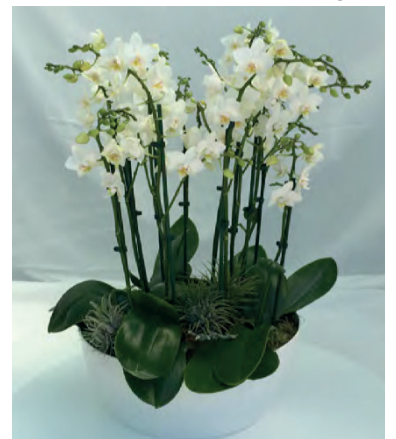
TD3 - Orchid Display [pre order only]