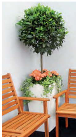
A11 - Bay Tree