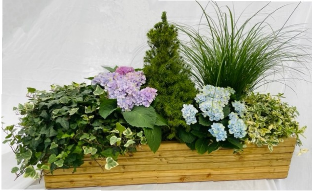
T3 - Rustic 1m Trough of Grasses and mixed foliage